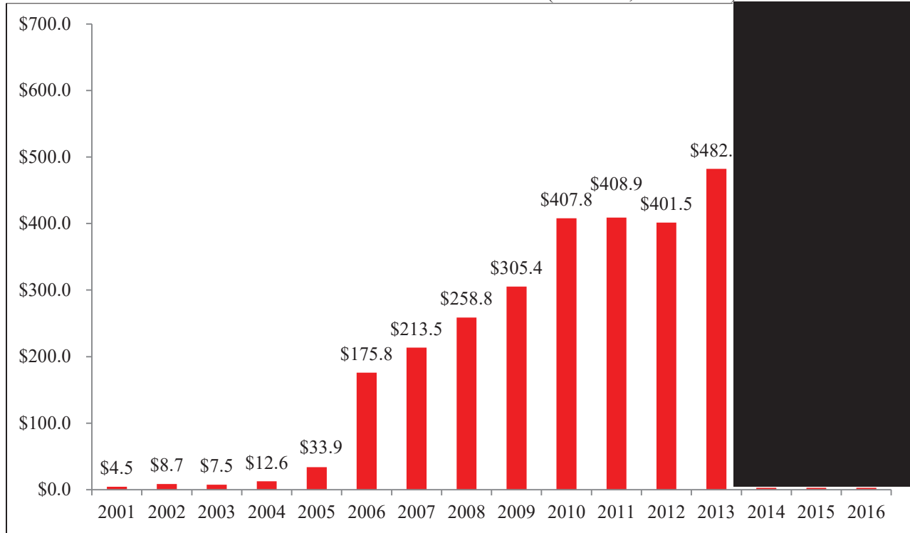
FIGURE A1: ZUFFA’S ANNUAL EVENT REVENUE (MILLIONS, 2001 – 2016)

Source: Backup materials to Singer Report, compiled from Zuffa consolidated annual financial statements.